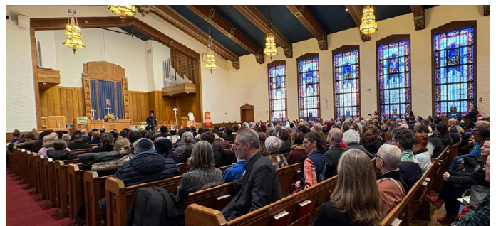
Hundreds gather at the Lutheran Church of the Reformation in Washington, DC, on January 29, 2026.

FAITH IN ACTION: Tell Congress to ensure immigrant enforcement respects human dignity. https://tinyurl.com/mu7k9fv3