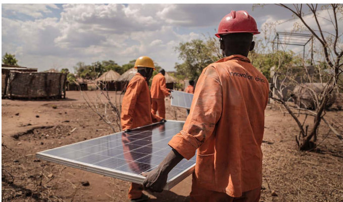
“Solar energy is driving change across rural Africa”

The fact that global spending on renewables is now outpacing military budgets proves that the tools for a sustainable world are being manufactured at an unprecedented scale. However, the eventual success of the “Green Leap Forward” depends on the world's largest economies acknowledging their role in the global carbon budget. Authentic stewardship of the planet requires that the historic polluters match Africa's ingenuity with the financial resources necessary to address the damage already done.§