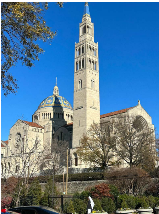
Basilica of the National Shrine of the Immaculate Conception in Washington, D.C.

IN EARLY FEBRUARY 2026, CATHOLIC bishops from the United States and the African continent met in Washington, D.C., to formalize a new era of spiritual and social partnership. The centerpieces of this gathering were the release of a landmark joint statement, “ Brothers and Sisters in Hope ,” and