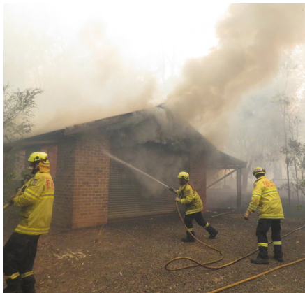
Photo of firefighters during 2019 Australian bush fire

The BBC highlighted a 2014 study predicting that extreme climate and weather events caused by the dipole will become more common in the future as greenhouse gas emissions increase. These scientists project that the frequency of extreme positive dipole events will increase this century from one every 17.3 years to one every 6.3 years.§