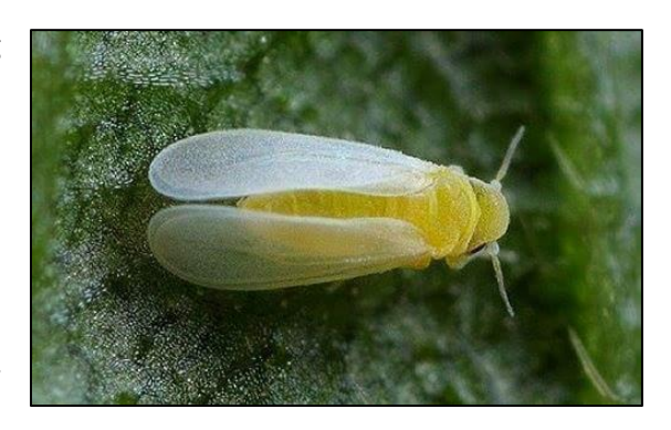
A whitefly, the pest that farmers interviewed by the caravan say has descended from the highland plantations and destroyed subsistence farms in the lowlands during 2017.

As life has become more difficult in the lowlands, many farmers have decided to try their luck finding work in nearby cities, contributing to the rapid "favelization" of nearby towns like Bom Jesus, which lacks the infrastructure to take in so many new families.