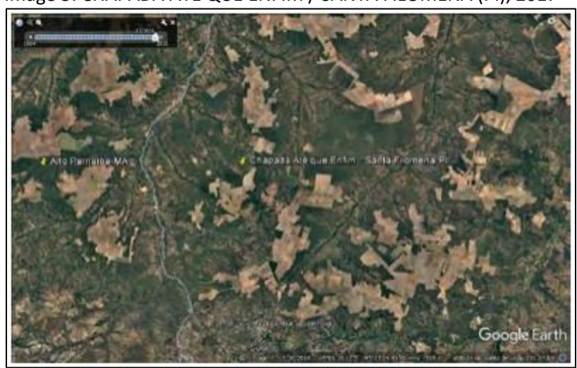
Image source: GOOGLE EARTH, May 2017 and published by ActionAid Brasil.