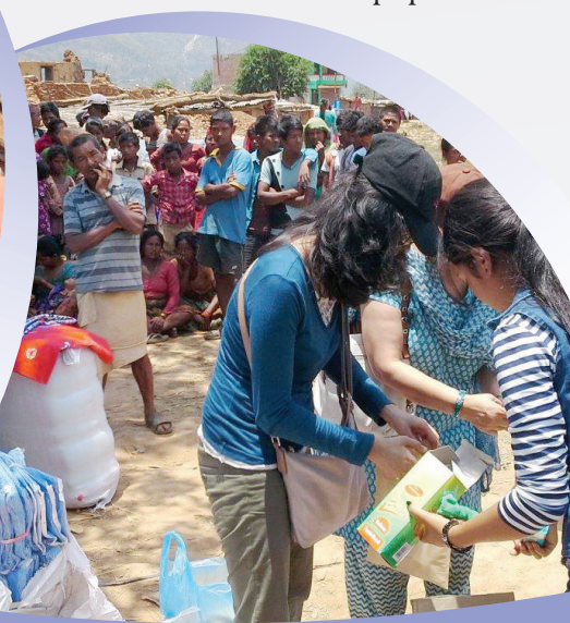
(Top) Maryknoll joined forces with other local groups to speed up the delivery of foodstuffs, especially in outlying regions.